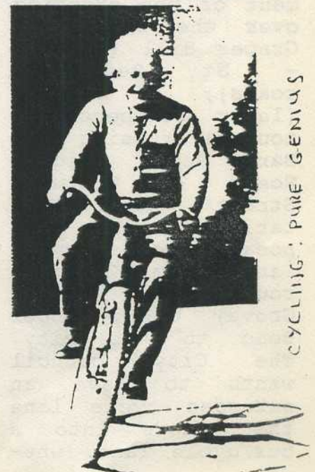
CYCLING: PURE GENIUS

has ranged from planning issues (eg Oak Street Guidelines, where we are pleased to hear that all our suggestions have now been accommodated within the document), to matters of detailed design (eg the road markings on Farmers Avenue have been altered at our suggestion).